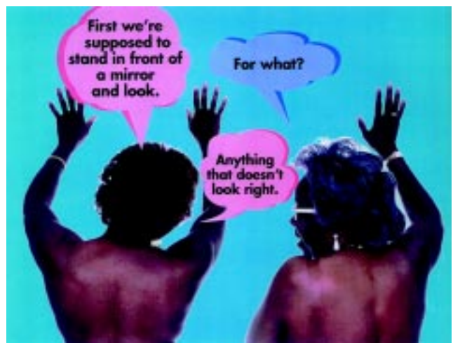
FIGURE 1. EXCERPTS FROM THE PICTURE BOOK RUBY AND PEARL: TWO JEWELS ON A JOURNEY (CONTINUED ON NEXT PAGE)

Note. From the College of Nursing at the University of Arkansas for Medical Sciences. Reprinted with permission.